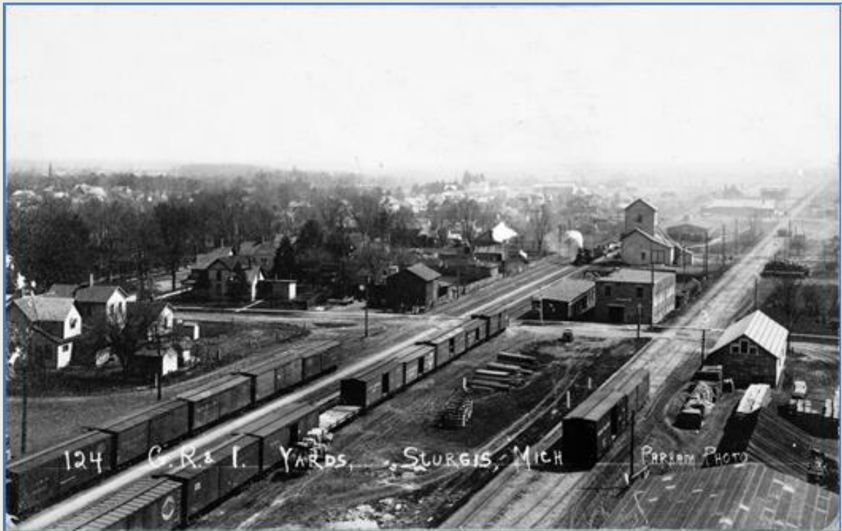
GR&I Yards Sturgis, MI Nov 14, 1912