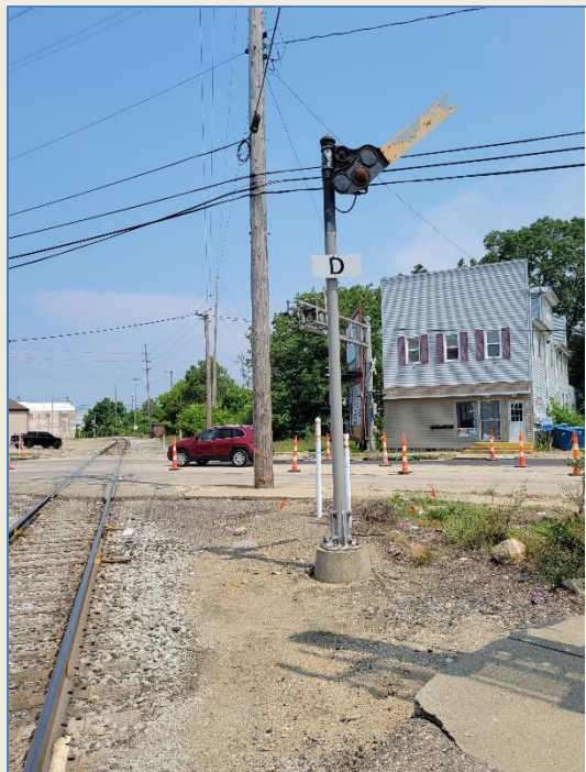
Upper quadrant semaphor signal found in downtown Kalamazoo, MI 8-05-2021

If you have some photos you've taken or have permission to submit for publication, please send scans of them to your editor for inclusion in our Prototype photo section. If you need help with this, contact Your editor.