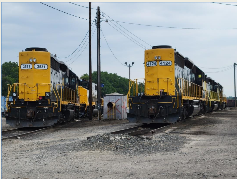
Grand Elk locomotives, Botsford Yard, Kalamazoo, MI Aug 5, 2021