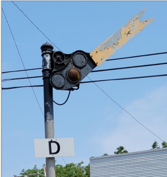
Upper Quadrant semaphor signal - detail