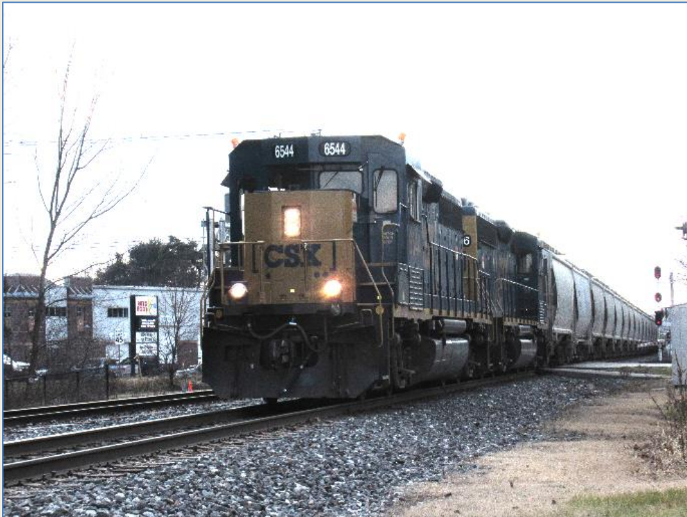
Train leaving the CSX Waverly Yard for Grand Rapids on Dec 16th, 2021.