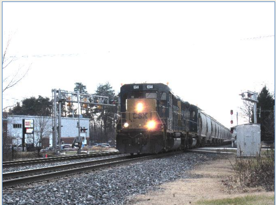
Caught a train leaving the CSX Waverly Yard for Grand Rapids on Dec 16th, 2021. It looks like a load of train cars that came down to Holland from Muskegon, frac sand and tank cars. "interchange"

If you have some photos you've taken or have permission to submit for publication, please send scans of them to your editor for inclusion in our Prototype photo section. If you need help with this, contact Your editor.