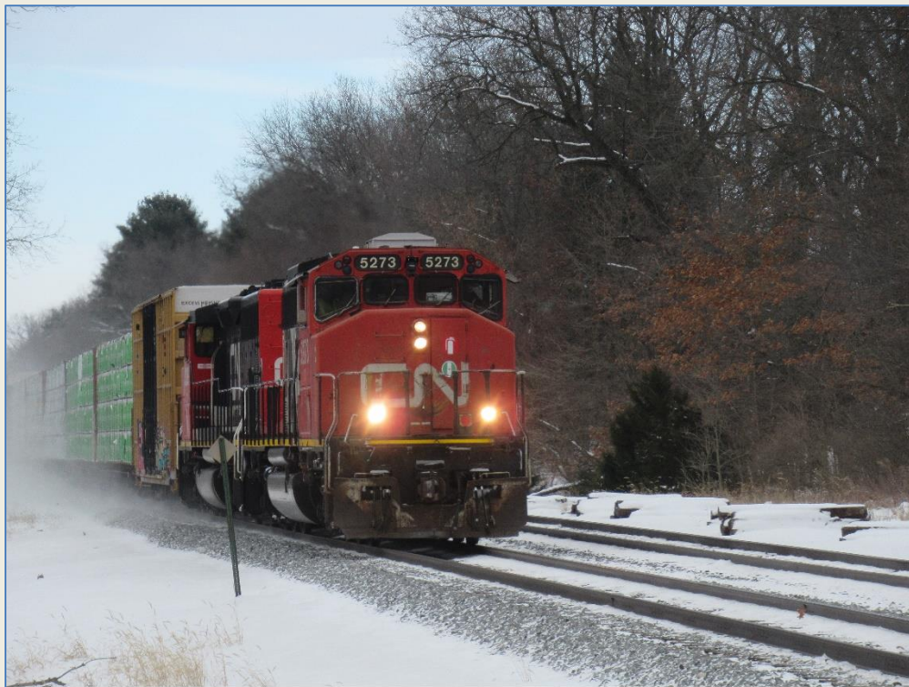
WB train CN #5273 at Scotts, MI on 1/8/2022