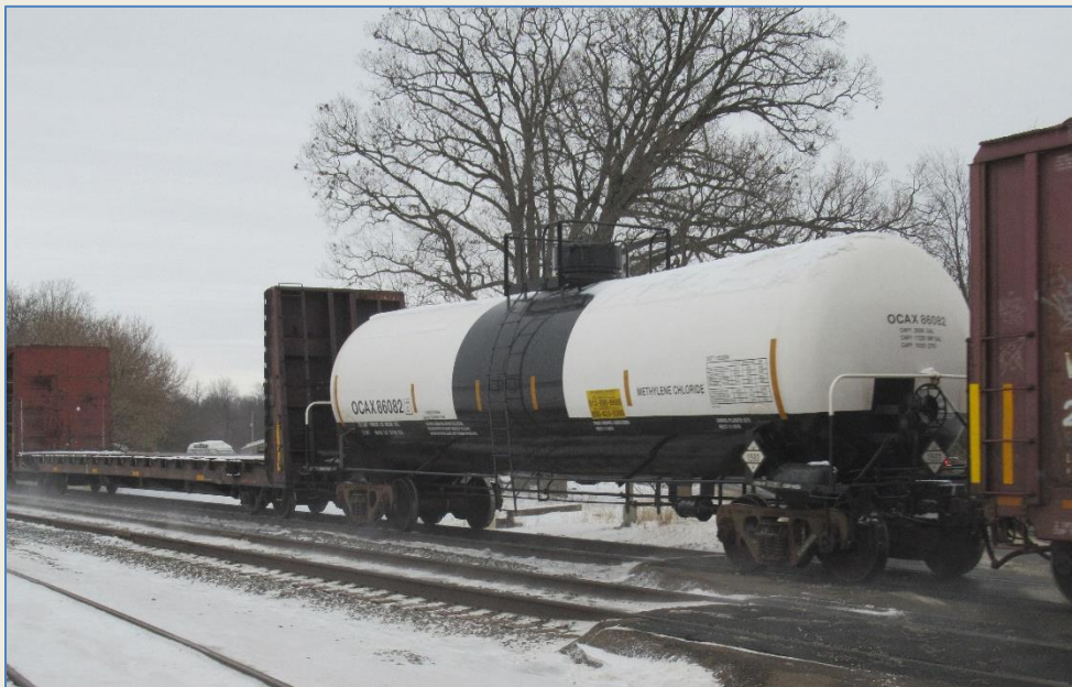
OCAX #86082 Tank car on the 4th train today - methylene chloride UN 1593, also known as dichloromethane, flammable, carcinogen.