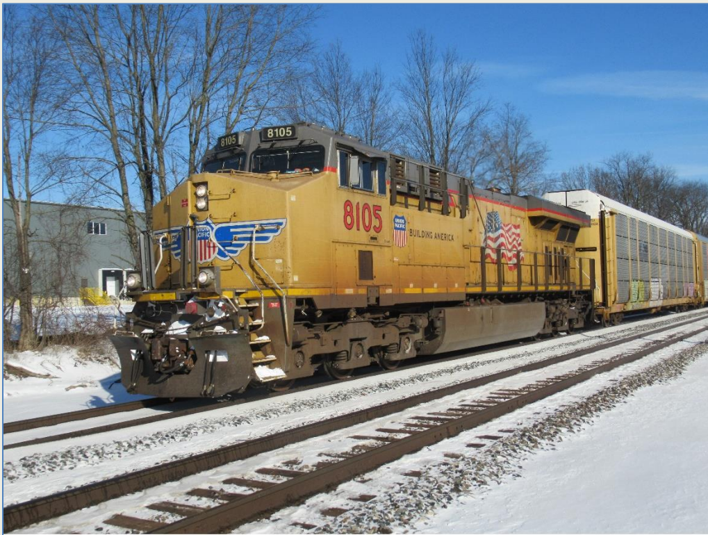
WB train UP #8105 near Battle Creek MI on 1/8/2022