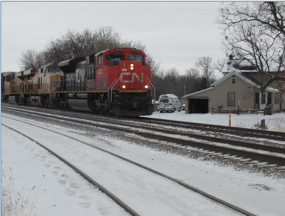
WB train CN #8928 near Pavillion MI on 1-8-2022