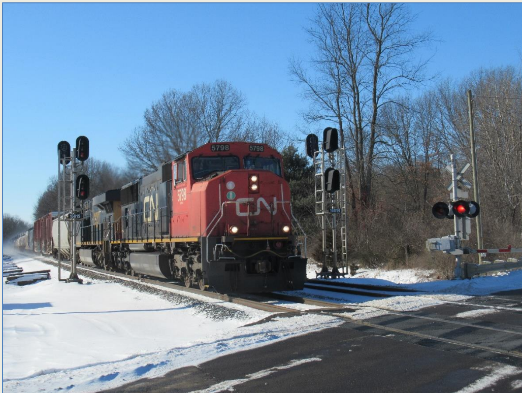
EB train CN #5798 near Battle Creek MI on 1/8/2022