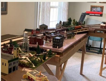
These two pictures are from my current layout.