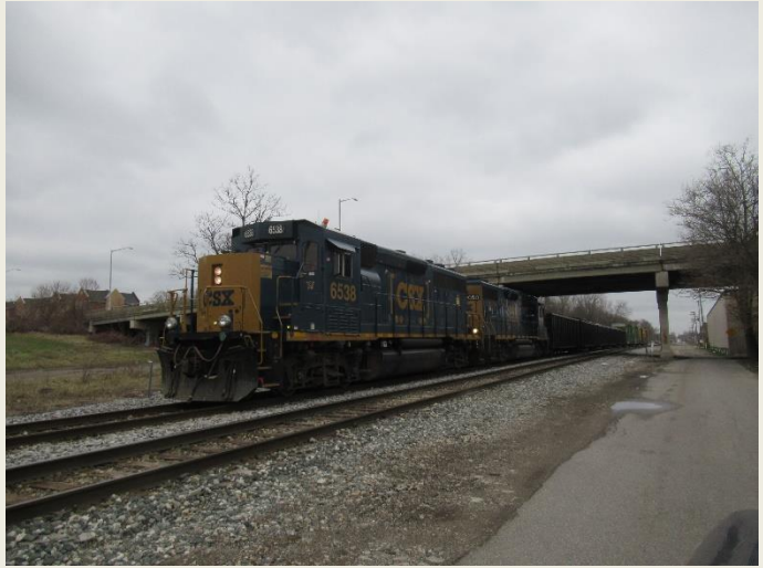
CSX freight train heading west to the CSX Wyoming, MI yard from switching activities, waiting for a green light.