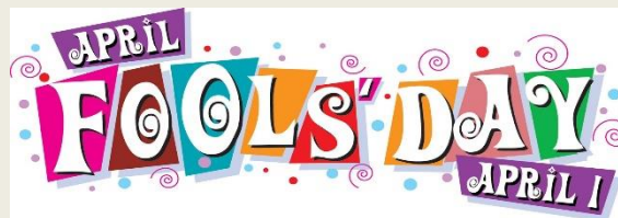
April Fool's Day – April 1st