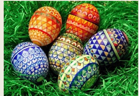
Easter March 31st