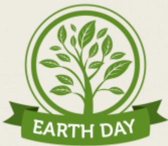
Earth Day April - 22nd