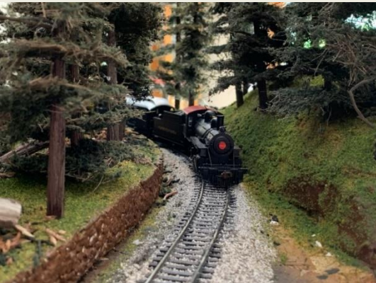
The picture on the left displays a Steam engine (Penn. #3233 2-6-0) pulling a passenger train through a wooded area.

The picture below shows my layout suspended from the ceiling when we had a major water problem in our basement.