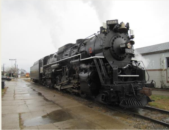
This photo is the Pere Marquette Steam Engine # 1225, from the Steam Railroading Institute.